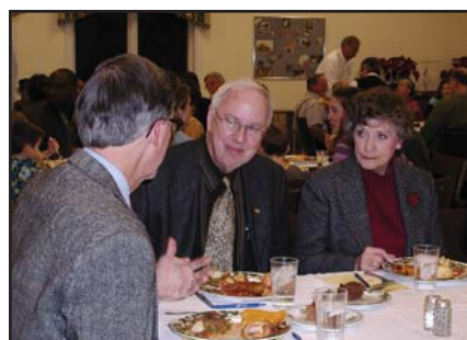
Celebration of Missions attenders in Richmond enjoy fellowship at the dinner and program.